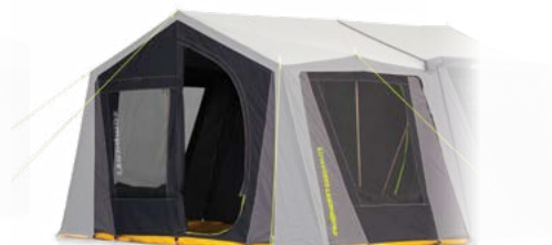
ON A ZEMPIRE® POLE CANVAS TENT