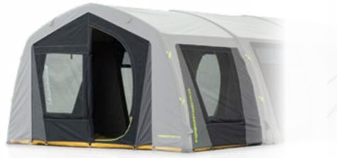
ON A ZEMPIRE® AIR CANVAS TENT

Airforce 1 VI/V2 , Jet Force, Titan, Atlas, Millbrook (2010 onwards), Sheraton, Duxton, Mission Control